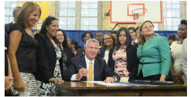
Mayor Bill de Blasio signing legislation increasing access to menstrual products for New York City's shelters, students, inmates, July 13 2016.